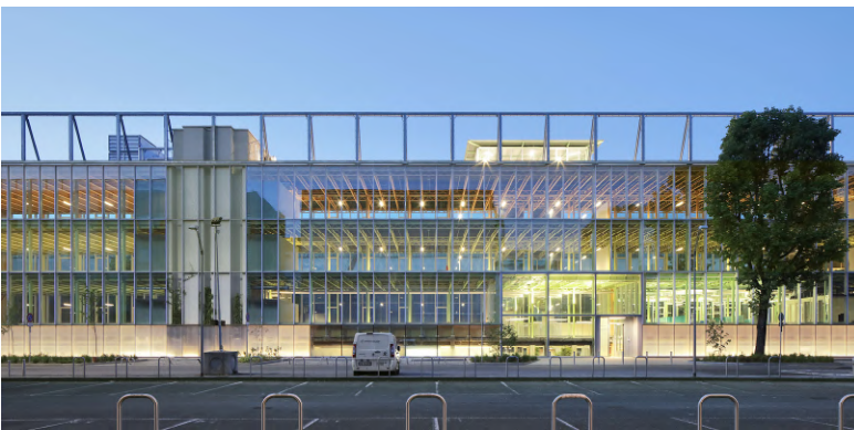
Bicocca Superlab, Viale Sarca 336, Milan

BALANCE’s works have been presented in national and international lectures, conferences and congress such Turin, Milan, Venice, Rome, Selinunte, Paris, New York, Kyoto, Lubljana, Brescia, Tashkent.